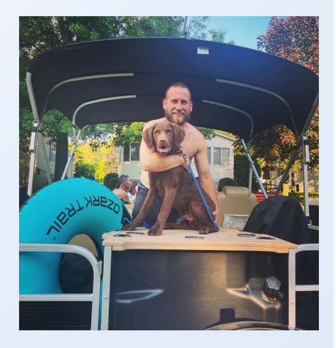
This is another photo of my dog Diesel and I getting ready to depart the marina for a family boat outing.