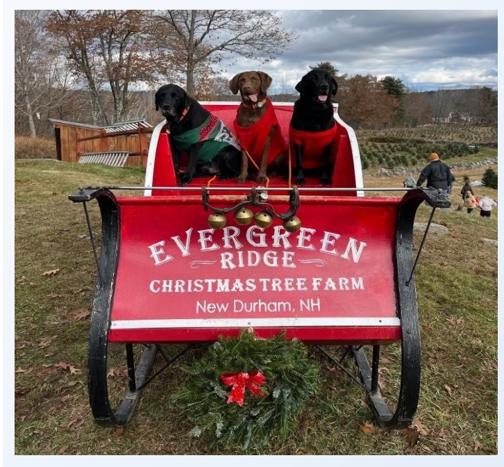
These are my dogs, aka my best friends (L-R) is Tuukka 10 (English Black Lab), Diesel 2 (Chesapeake Bay Retriever), and Jake 5 (1/2 English Black Lab & 1/2 Chesapeake Bay Retriever)